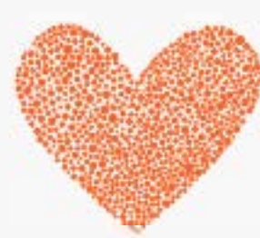
"Our Gang" Little Rascals