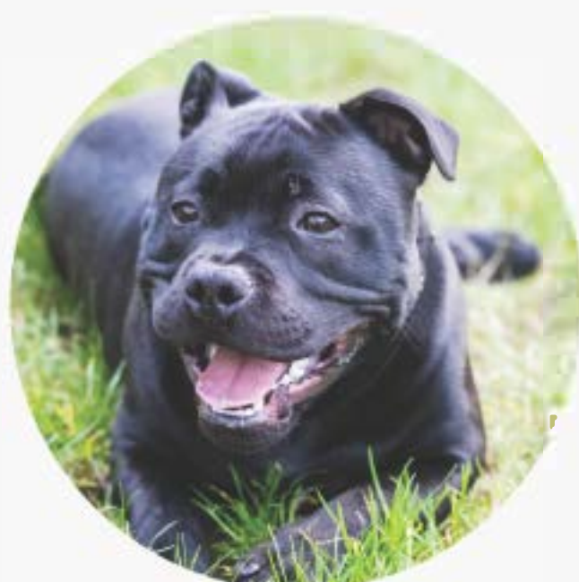
Staffordshire bull terriers